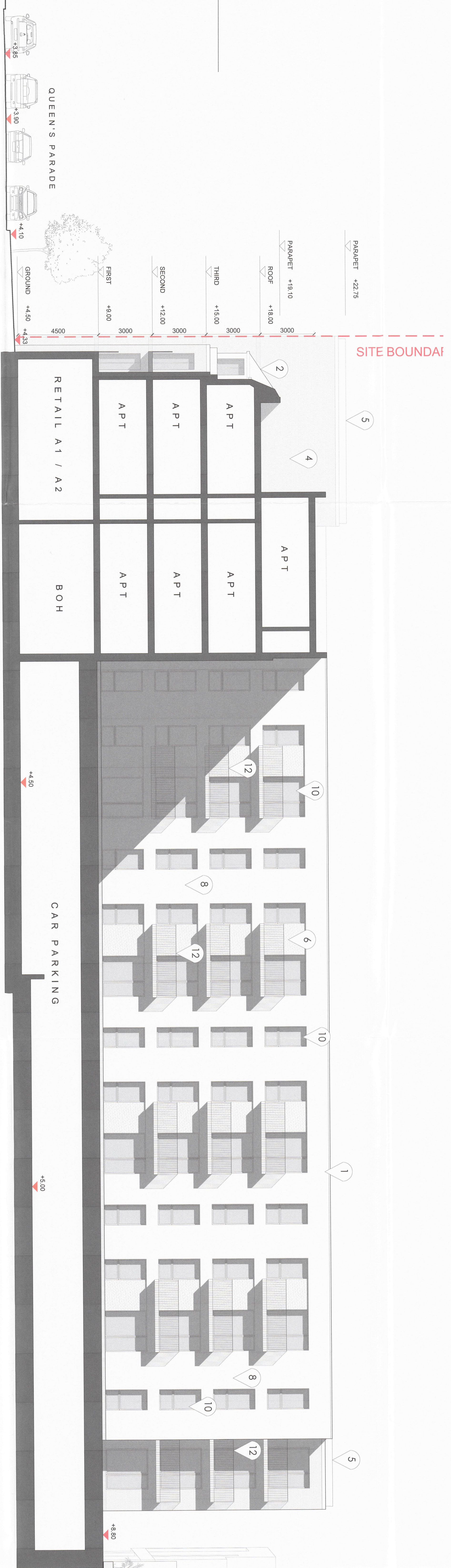
PROPOSED SECTION 12 1:100@A1