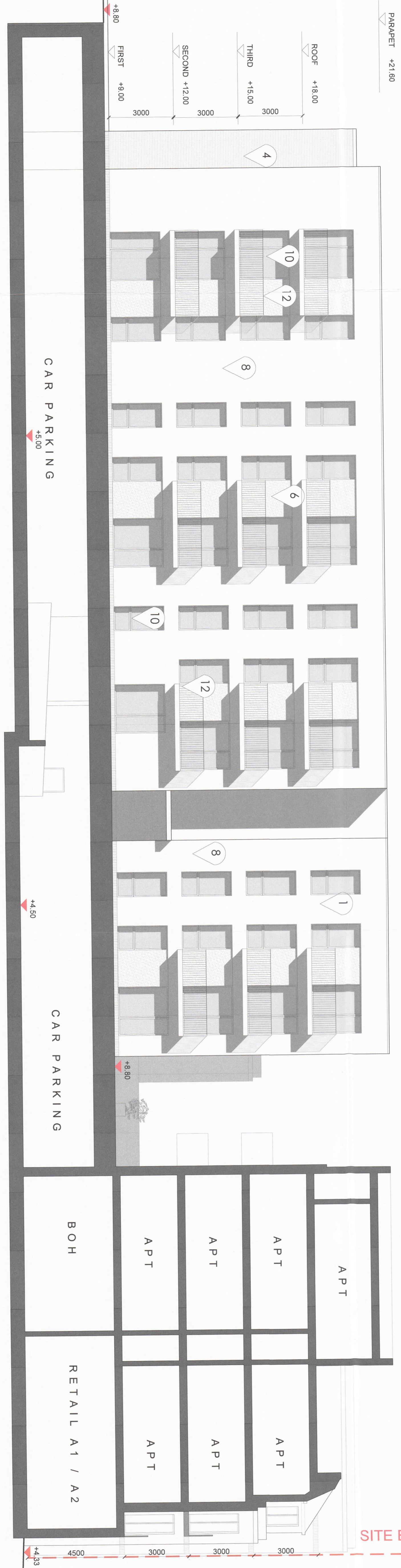
PROPOSED SECTION 11 1:100 @ A1