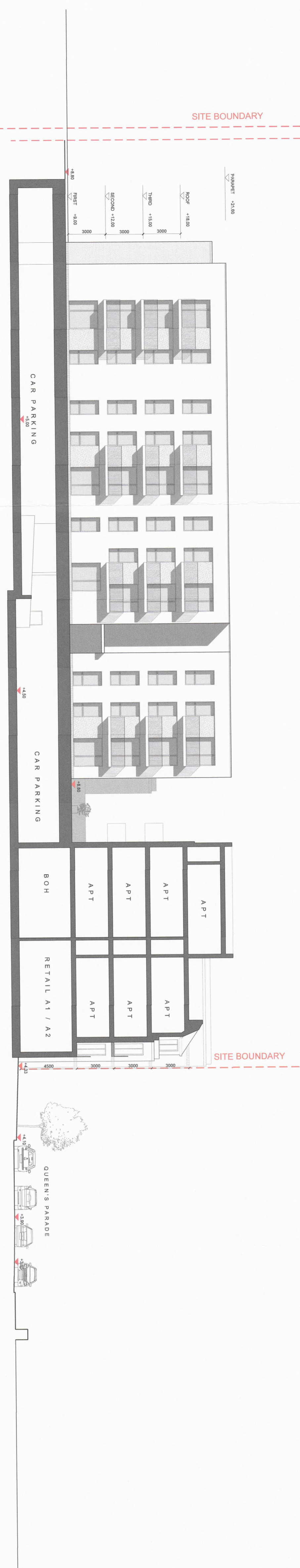
PROPOSED SECTION 11 1:200 @ A1