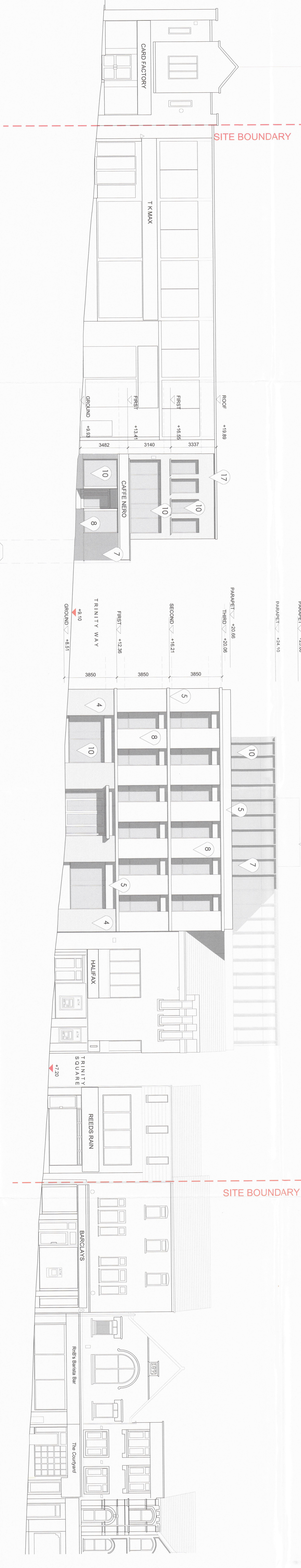
PROPOSED ELEVATION 1 [MAIN STREET]- PART 1 1:100@A0